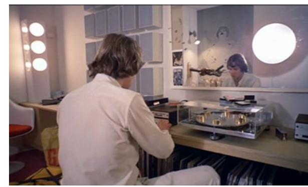
Hydraulic Reference Turntable being used in the film 'A Clockwork Orange (1972)'