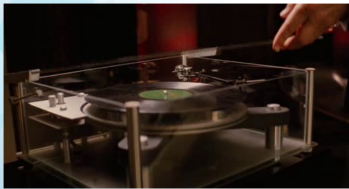
Hydraulic Reference Turntable being used in the film 'X-Men First Class (2011)'