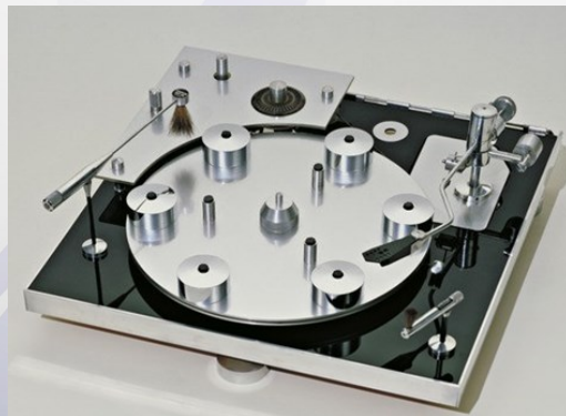
Transcriptor's Ltd Hydraulic Reference Turntable (1964) on display at MOMA